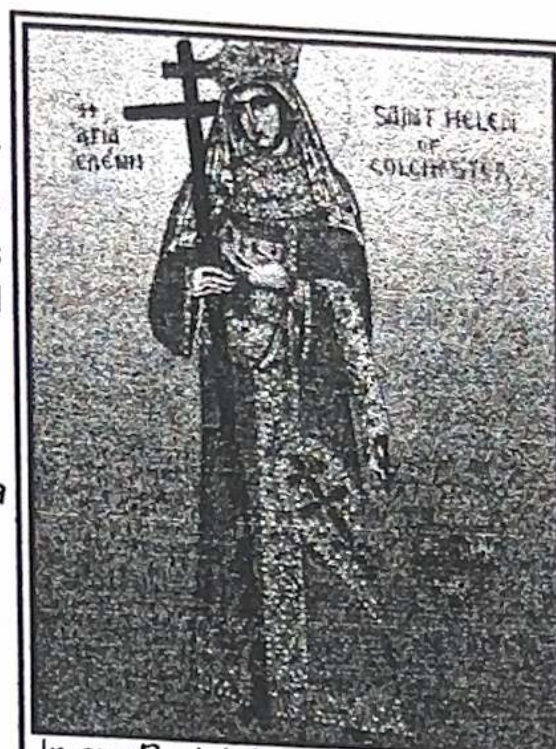
In our Parish Icon St Helen holds the Holy Cross she discovered in Jerusalem in her right hand and her Colchester Chapel in the left.